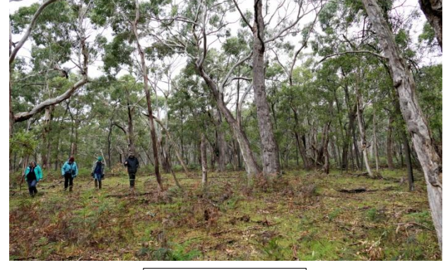
Open area on a rise

Stop 2 . The vegetation here, particularly near the edge, was much different from that at Stop 1.