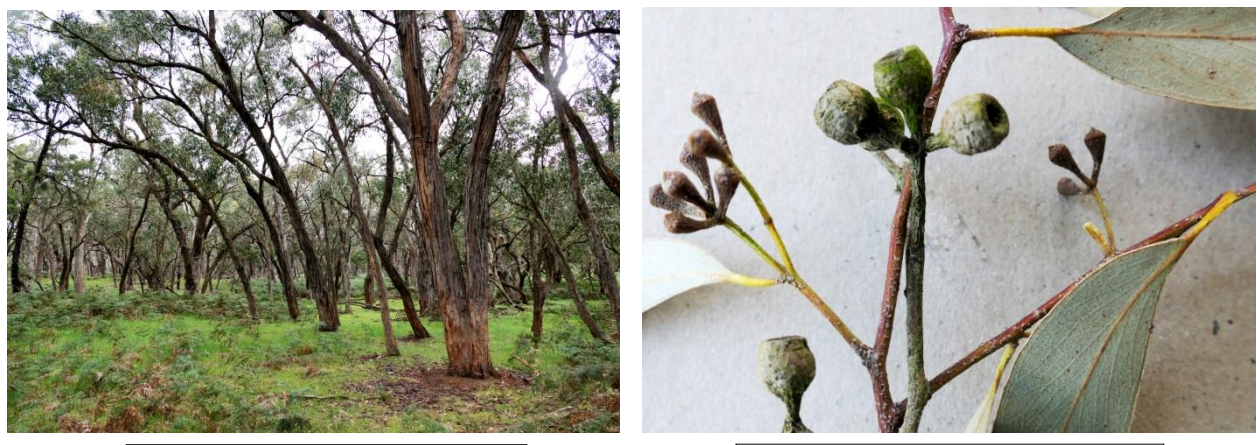
Messmate on the edge of this block