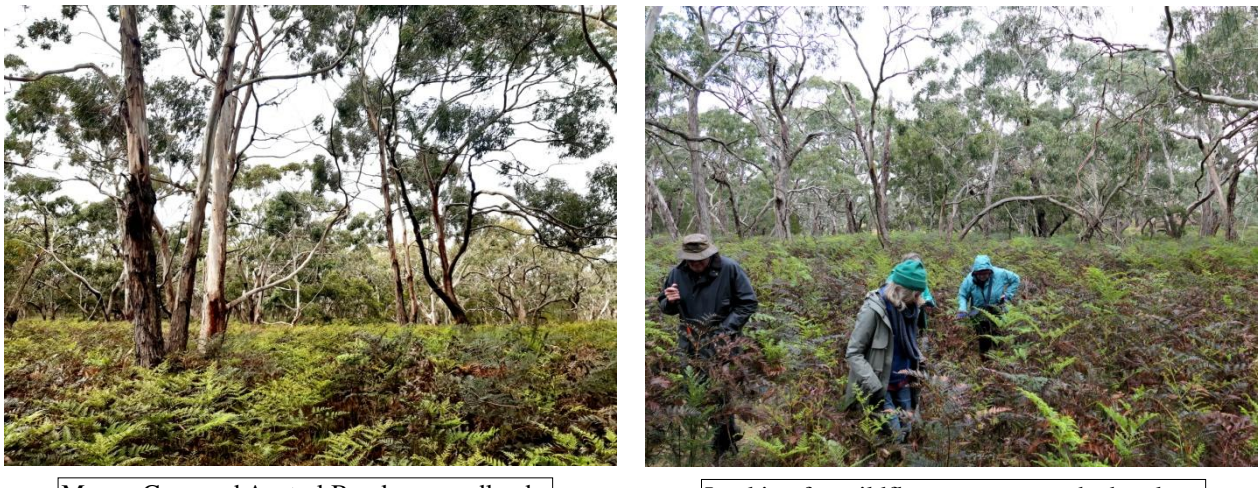
Manna Gum and Austral Bracken woodland

Our first impression at Site 1 was the dominance of what appears to be a single eucalypt species – Manna Gum – and that of Austral Bracken ( Pteridophyta esculentum ). That is not unlike the vegetation of Mount Napier State Park where the soil has developed on basalt that is only about 36,000 years old.