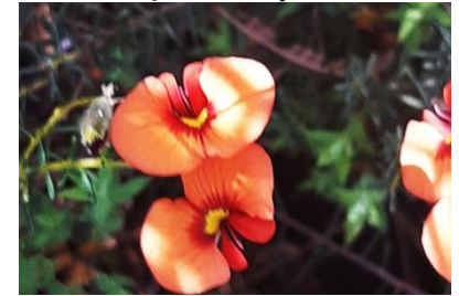
Pultenea humilis – Dwarf Bush-pea