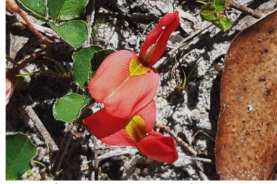
Kennedia prostrata - Running Postman