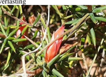
Stenanthera conostephioides– Flame Heath

Coronidium scorpioides – Button Everlasting