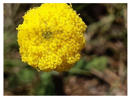
Craspedia variabilis – Billy-buttons