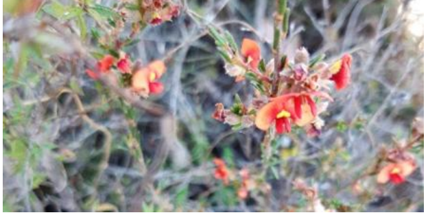
Dillwynia sericea - Showy Parrot-pea