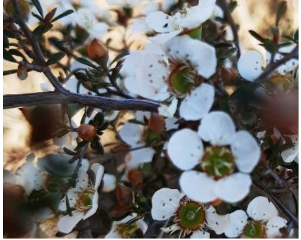
Leptospermum sp. – Heath Tea-tree