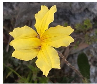
Goodenia geniculata – Bent Goodenia