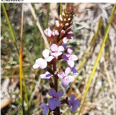
Stylidium gramminifolium – Trigger Plant