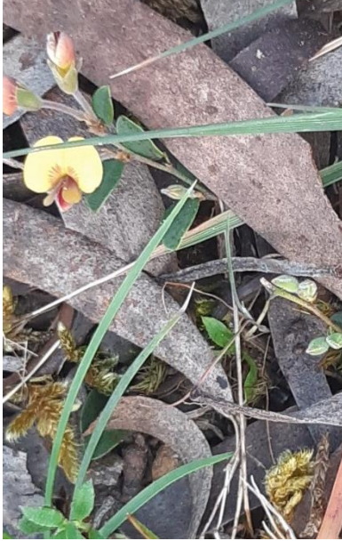
Bossiaea prostrata – Creeping Bossiaea