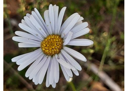
A Brachyscome daisy