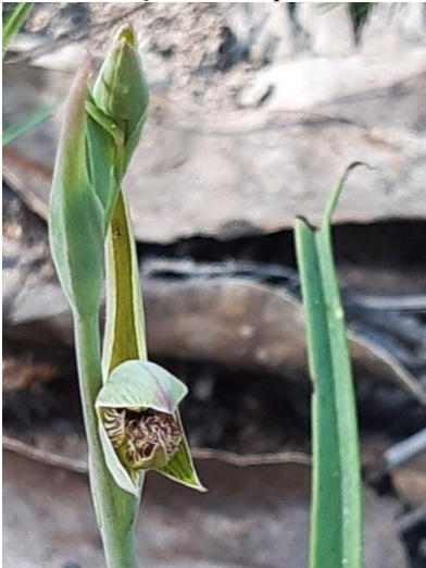
Calochilus robertsonii – Purple Beard Orchid in bud