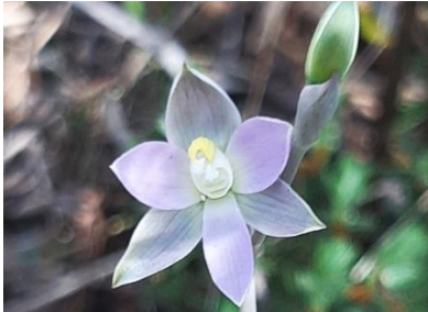
Thelymitra pauciflora – Slender Sun Orchid