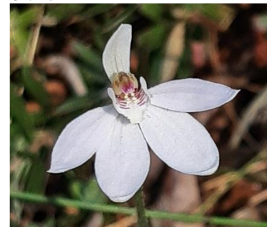
Caladenia pusilla - Tiny Fingers