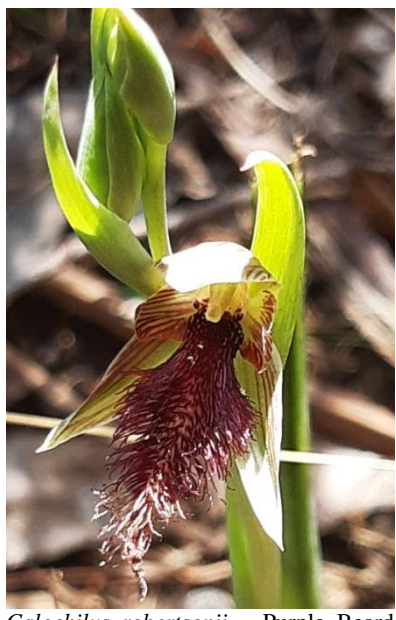
Calochilus robertsonii – Purple Beard Orchid