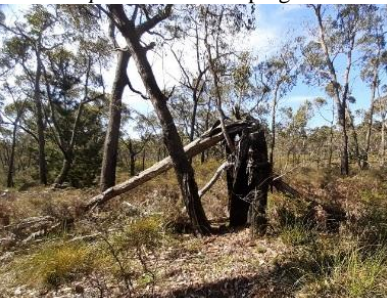
Our tree of interest

<u>Birds seen for the day</u>: Brolga Gang Gang Cockatoo Crimson Rosella