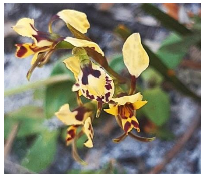
Diuris curvifolia – Leopard Orchid