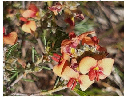
Dillwynia sericea – Showy Parrot-pea