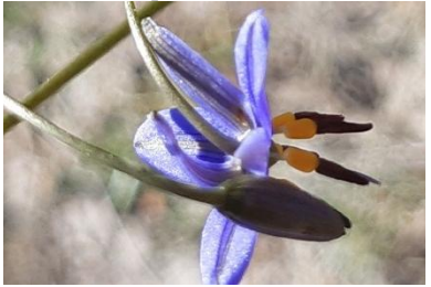
Dianella revoluta – Black-anther Flax Lily