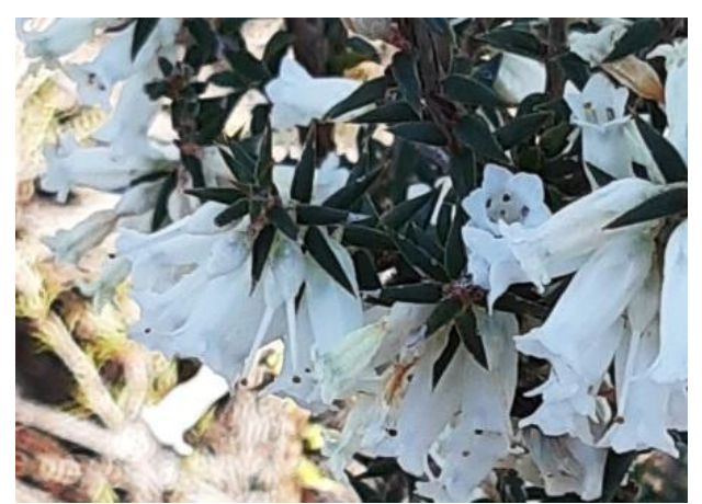
Epacris impressa - Common Heath