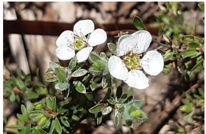
Leptospermum myrsinoides – Heath Tea-tree