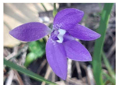
Glossodia major – Wax-lip Orchid