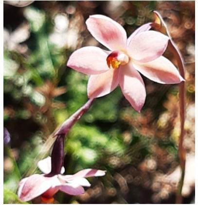
Weecurra State Forest

Well, like last time, the strappy leaves were visible and indicated many plants present – but none were in flower. We did see Glossodias and Caladenias as well as other spring flowers. And having arrived at the proposed first place of the tour as the last place, the excursion ended and we each went our own ways home. Pam dropped me off at home.