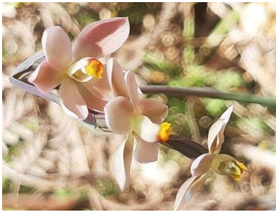
Thelymitra rubra - Salmon Sun Orchid