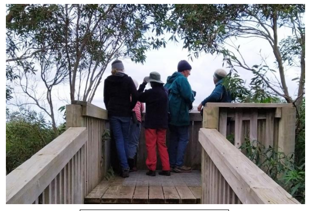
Lunch at Picnic Hill