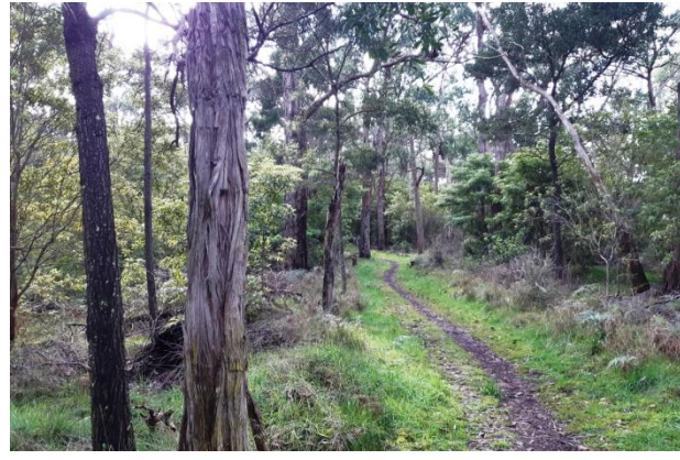
Trail through Loreto Reserve