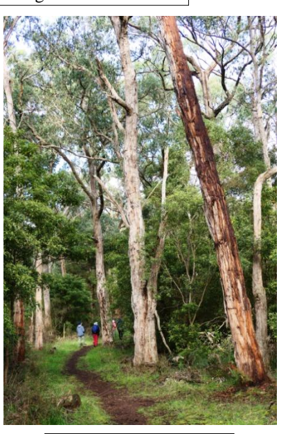
Brown Stringybark trail