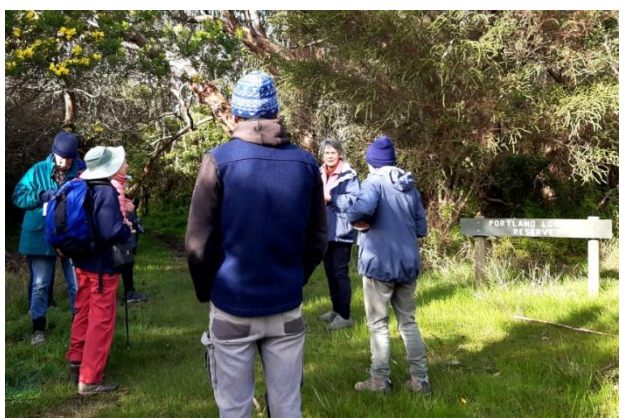
Ruth addresses the group at Loreto Reserve

This reserve is infested with Sweet Pittosporum ( Pittosporum undulatum ). The tree is a bountiful source of fruit for many birds and mammals; where other forests are cleared or now degraded, this tree may be the means of ensuring the continued presence of some fauna in the region. Perhaps there is a place for 'problem' trees in a few reserves and roadsides where they can be contained. It was obvious that Sparaxis bulbifera , Bridal Creeper ( Asparagus asparagoides ) and Periwinkle ( Vinca major ) are entering the reserve along the tracks – the best way to limit the spread is to work back from the furthest infestation. Despite the Pittosporum and other weeds, we enjoyed the time we spent in the reserve.