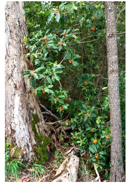
Sweet Pittosporum with fruit