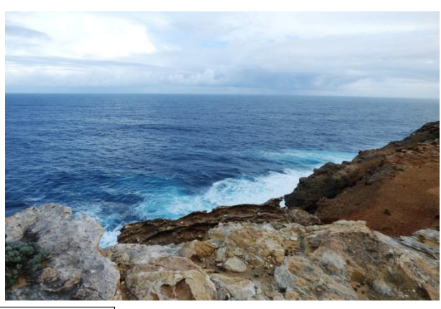
Cape Nelson Lighthouse and cliffs

A phone call to Ruth revealed that she and the others were back near the cars! They had slipped onto another part of the GSW walk. We walked back along the road from the lighthouse and found Ruth. Fortunately, the threatening clouds had not broken and we had time to see the Striped Greenhood ( Pterostylis striata ), Small Gnat Orchid ( Cyrtostylis reniformis ) and Slaty Helmet Orchid ( Corybas incurvus ) and a few other flowering plants, including Cranberry Heath ( Styphelia humifusa ), Common Correa ( Correa reflexa ), White Correa ( Correa alba ) and Coast Beard-heath ( Leucopogon parviflorus ).