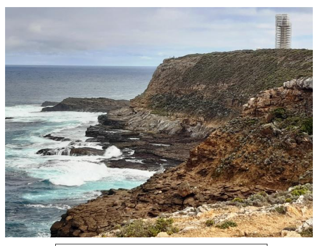
Cape Nelson cliff and Lighthouse..

Birds seen or heard along the walk included Singing Honeyeaters, Red Wattlebird, Grey Shrike-thrush, Fan-tailed Cuckoo, Welcome Swallow, Kelp Gull, Silver-eye, Willie Wagtail, Superb Fairy-wren, Crimson Rosella and Australasian Gannet.