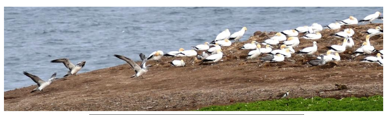
Views of the gannet colony from the fence and from the lookout