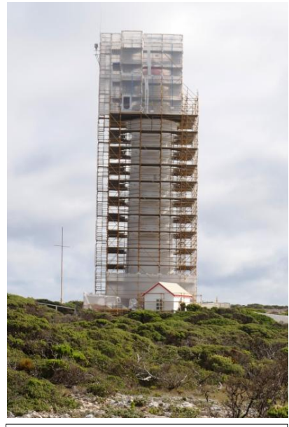
'Wrapped' Cape Nelson Lighthouse

An Eastern Yellow Robin appeared while we were at lunch. Another 'local' was a Bulldog Ant (Myrmecia nigricans).