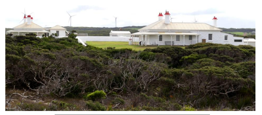
Lighthouse Keeper's cottage & PV buildings

Back at the Cape Nelson Lighthouse, we heard a melodious Rufous Bristlebird calling from the bushes on the edge of the car park.