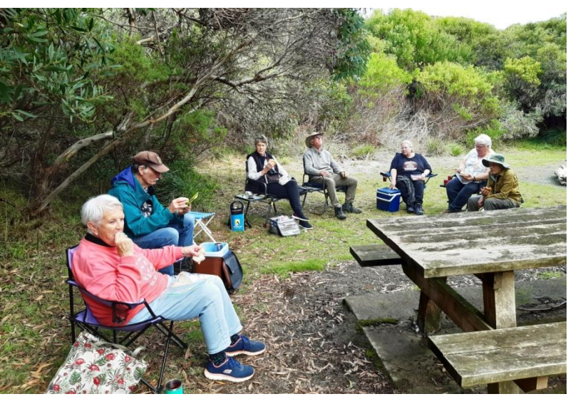
Picnic lunch spot DL

We retrieved the vehicles left at the start of our walk and then drove to a picnic area on the scenic drive where we had lunch.