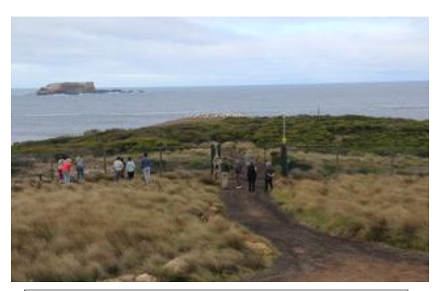
View to the gannet colony and Lawrence Rock VK

We saw 4 or 5 juveniles excercising their wings. Diane noticed a bird with a black gular stripe; perhaps a vagrant Cape Gannet (see photo). A couple of Masked Lapwings and White-faced Heron prowled around the edge of the group. There were no Siler Gulls present in the flock of about 150 gannets.