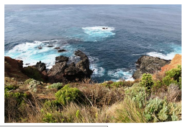
Cliff scenes above show some geological features of Cape Nelson

We observed several Australian Fur Seals moving around on a lava pavement below us, at the base of the cliff. The sea periodically swept across the platform and it provided an easy landing area for the seals. Another 20 seals were resting on the rock-strewn pavement further up the slope.