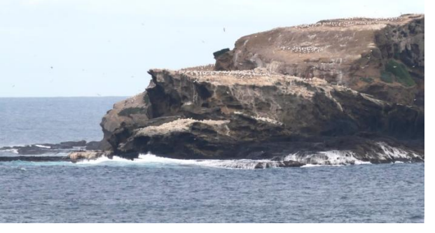
Seabirds on Lawrence Rock

We then walked back to the Lighthouse along the Great South West Walk. The only eucalypt here was the Coast Gum or Soap Mallee ( E. diversifolia ssp. megacarpa ), a species confined in Victoria to limestone cliffs at Cape Nelson. It also occurs on coastal areas of SE SA.