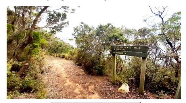
Great South West Walk DL

Views were had from the cliff top of Lawrence Rocks and Cape Sir William Grant, across Nelson Bay. There were groups of roosting Australian Gannets at 3 levels on Lawrence Rock.