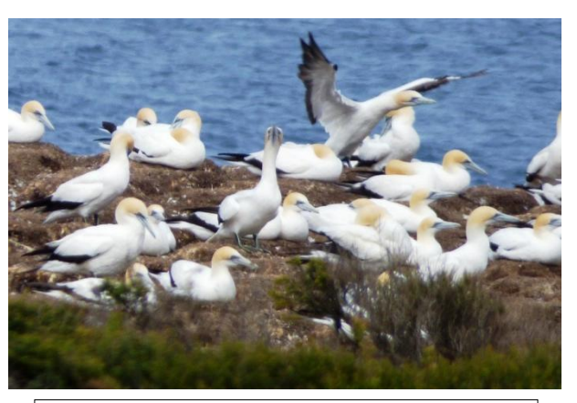
Australasian Gannets & possible Cape Gannet DL