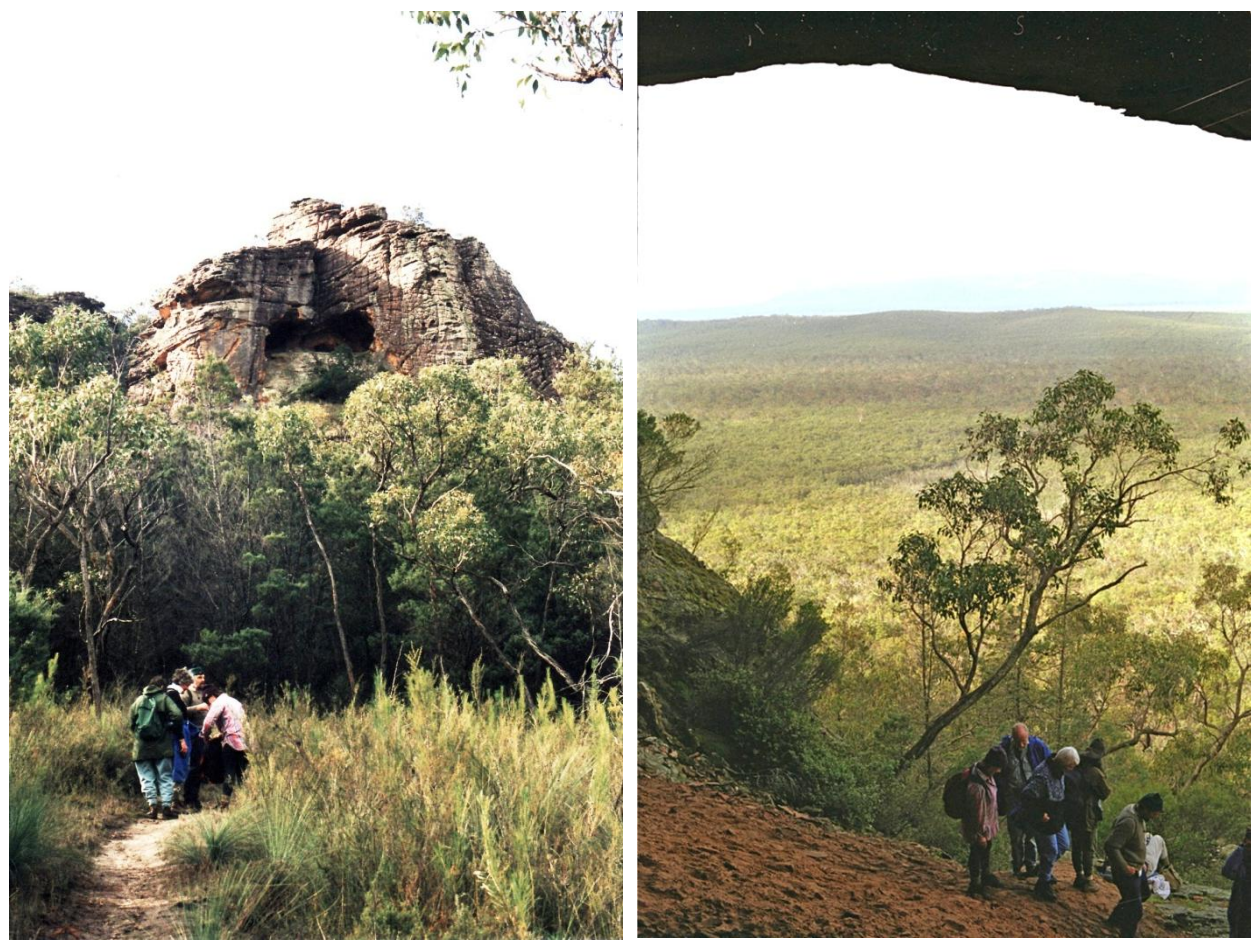
HFNC members approaching Burrunj Range

After a fairly sharp ascent to near the top of the range we located the cave at the base of a small sandstone cliff facing to the SW (that is not the cave in the cliff shown in the photograph below – Wildman's Cave is found a short distance to the right on the range).