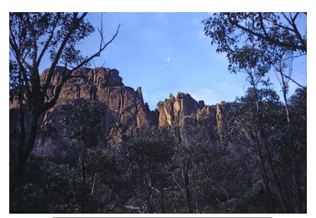
Chimney Pots viewed from the south LE

We had an early lunch in the waterworks clearing and started walking at 12.30. The track was well marked with red metal tags on the trees and led right around the Chimney Pot rock masses. Three members of the party reached the highest point on the Chimney Pot.