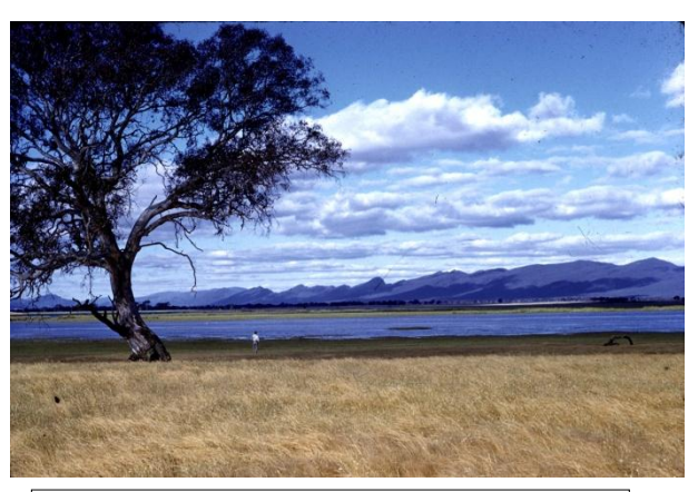
View of Serra Range from Bryan Swamp in 1961

Returning to Hamilton, attention was drawn to a fine plantation of trees up to 50 ft high, which had the appearance of having been burnt. Close examination showed the cause: damage by grasshoppers, through the insufficiency of ibis to cope with them.