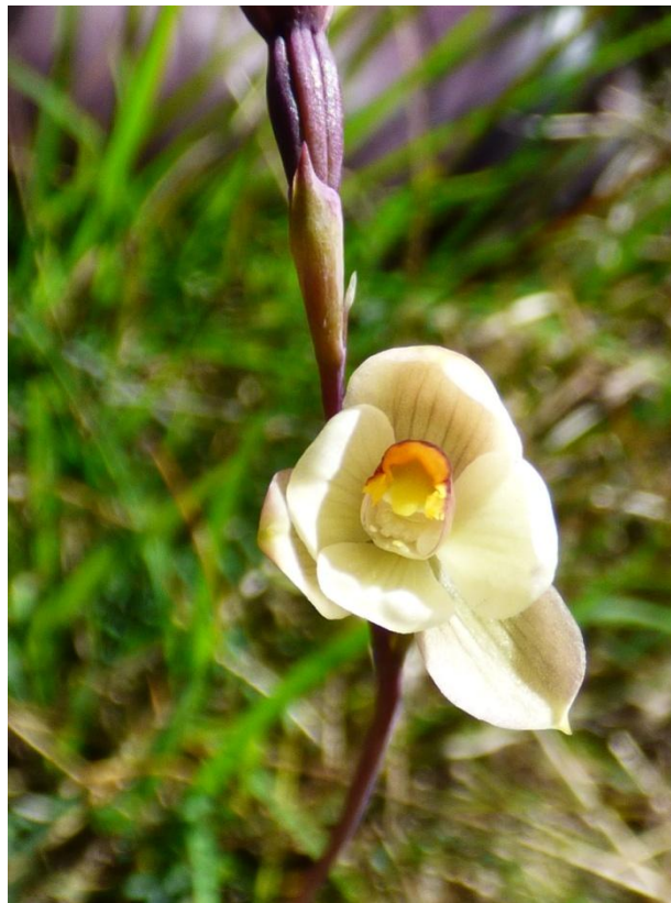
Thelymitra flexuosa x hybrid DL Oct 2017