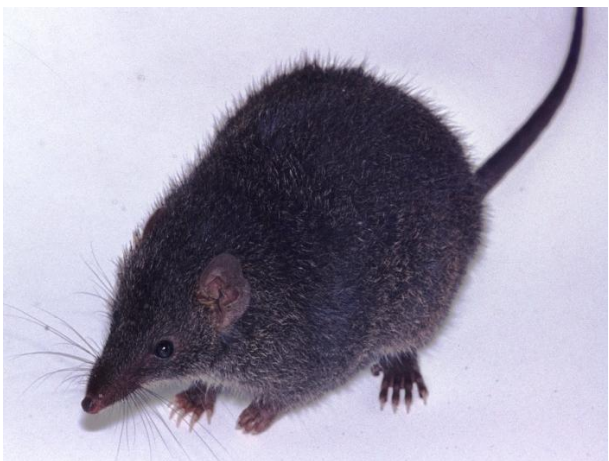
Photo 6. Sminthopsis crassicaudata