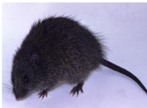
Photo 12. Pseudomys shortridgei