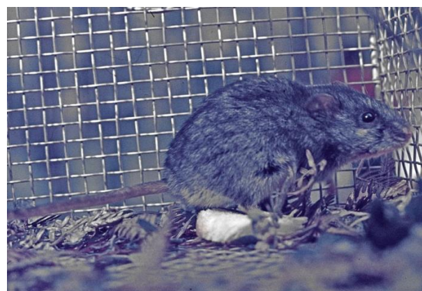
Photo 14. Rattus rattus