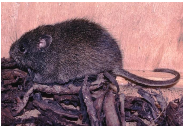
Photo 13. Pseudomys fumeus