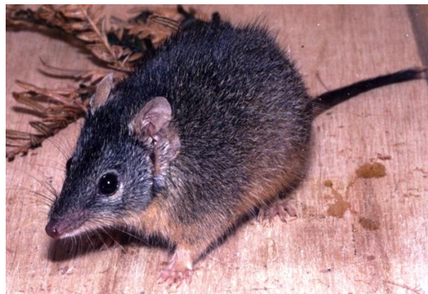
Photo 10. Rattus fuscipes