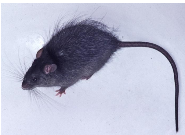
Photo 15. Rattus norvegicus