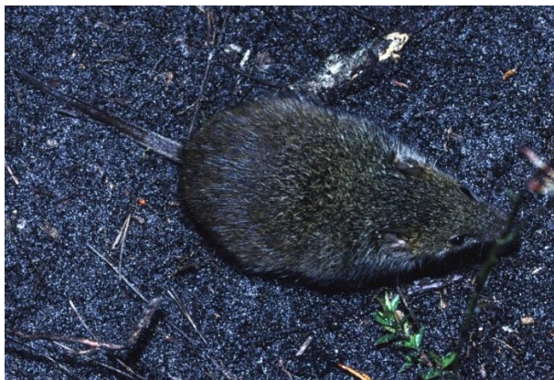
Photo 9. Antechinus flavipes