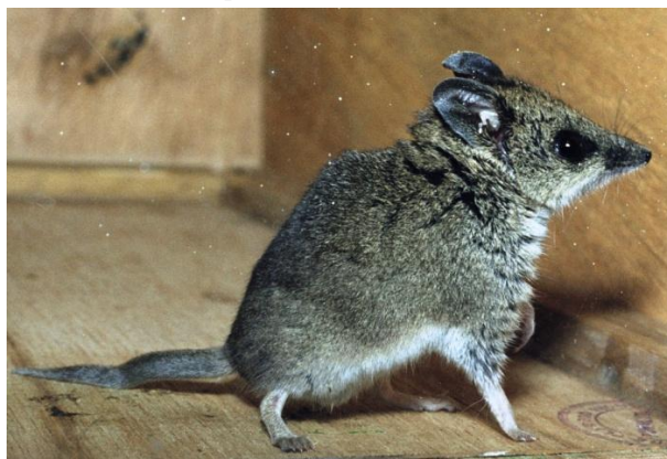
Photo 7. Mus musculus