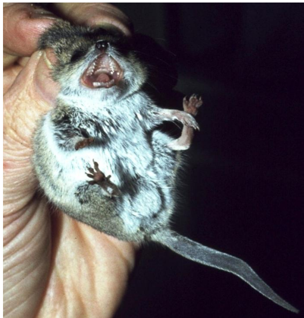
Photo 3. Antechinus agilis