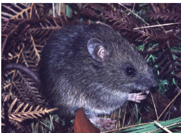
Photo 11. Rattus lutreolus