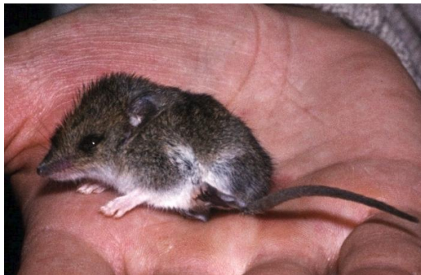
Photo 5. Antechinus swainsonii