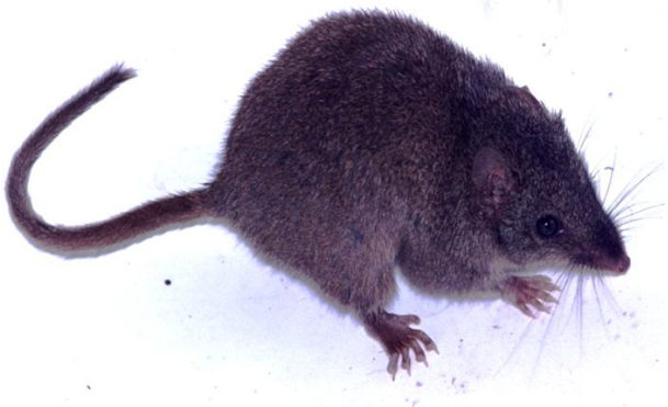
Photo 4. Sminthopsis murina