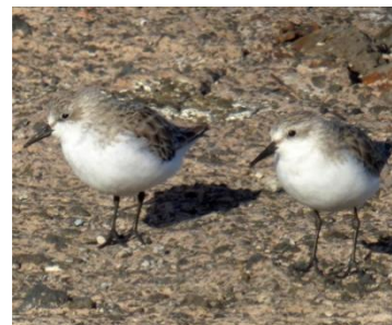
Red-necked Stints in non-breeding plumage (photo above).

Species not seen this year have been omitted from the table. The table includes 3 wetlands visited in January.