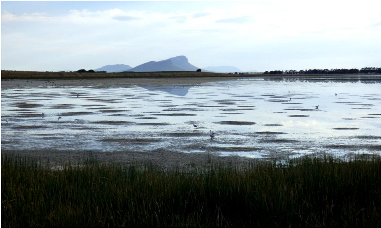
Photos above and below are of Lake Bullrush at 8 am on 22 Feb 2015, with a view of the Grampians beyond. Each photo shows the shallows, now reflecting the situation across most of the lake. The Brolga, ducks, lapwings, plovers, sandpipers, silver gulls, stilts, stints, spoonbills and swans are enjoying the conditions while they last – and that may only be for another week or two.