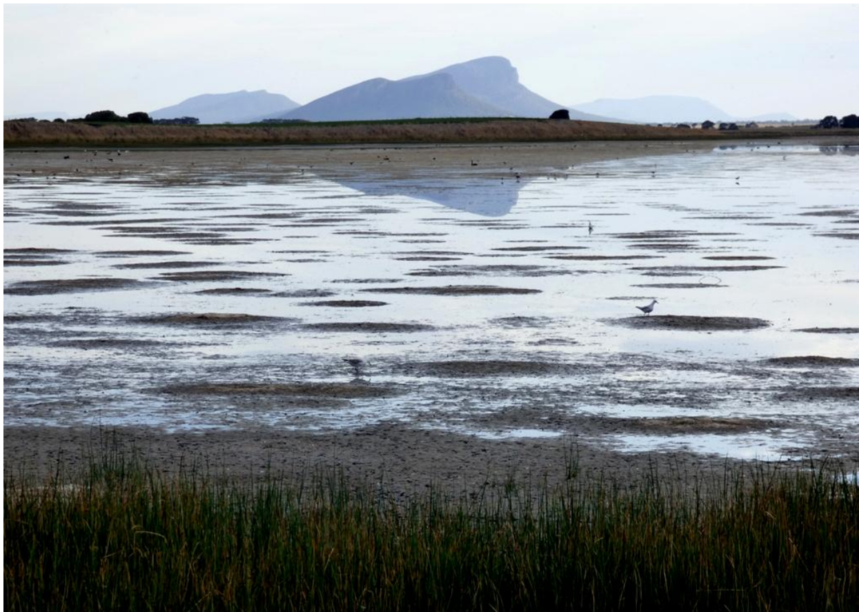
About 48 Brolga were seen by RZ & YI to settle on Lake Bullrush at dusk on 26 Feb. and they were still there at first light next morning when JH & YI visited. They counted 45 birds, which were still on the edge of the wetland (the distant shore seen above) after sunrise at 7.15 am. An adjacent farmer, Mark Tonnissen, observed that the birds had been around Bullrush for 2 months, and that the low water level in the lake was at least partly the result of water extraction by the Shire for road-making purposes.