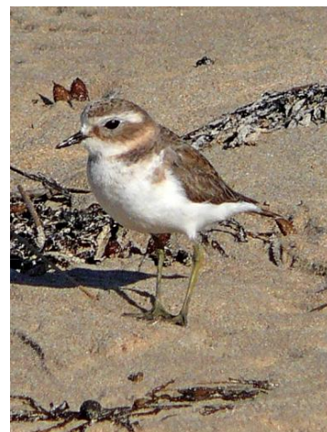
Double-banded Plover in non-breeding plumage (above).

The photo below has Black Swan, Spoonbills & Lapwings on the SW side of Lake Bullrush.