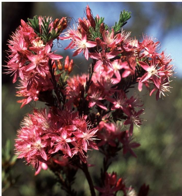
1. Calytrix tetragona , Jilpanger Flora Res