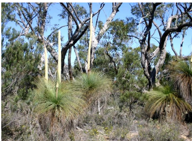
4. Xanthorrhoea australis at Jilpanger Flora Reserve