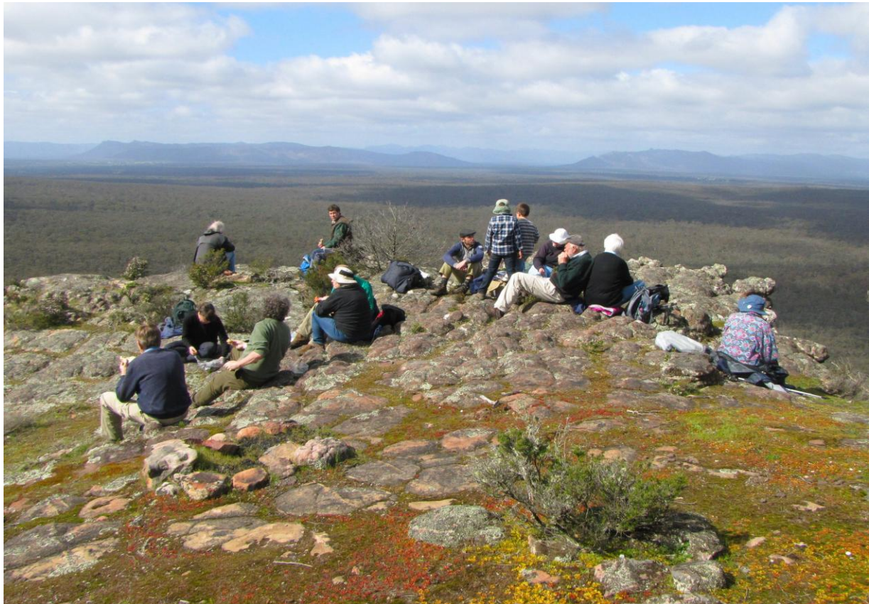
Lunch spot with a view.

Grey Currawong White-throated Treecreeper Grey Shrike-thrush Sulphur Crested Cockatoo Crimson Rosella Red Wattlebird