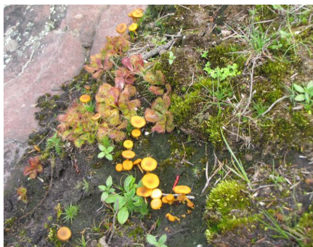
Yellow Bellybuttons and Scented Sundews